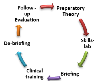
Figure 1: The clinical learning cycle of the Bachelors in Nursing Science

Clinical tutors are expert registered clinical nurses, with at least two years of clinical experience in a specific field, who are responsible for the students' clinical learning process; they assure the quality of the safety care provided by the students towards patients. Clinical Tutors ensure consistent clinical training in accordance with programmed learning aims, organise and monitor the progress of the educational strategy.